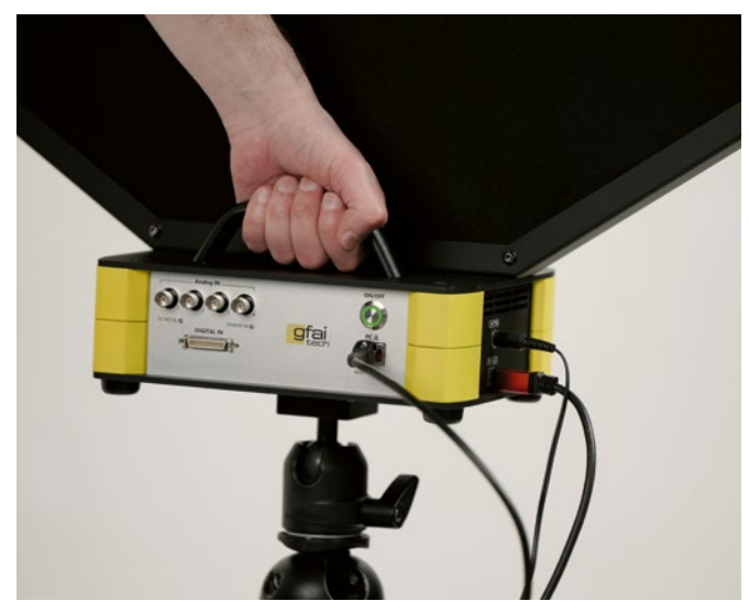
The Octagon can be placed on the ground or on a tripod

The fiber-carbon construction makes the Octagon stable and light at the same time, integrated handles allow for easy transport. All these features make the Octagon the perfect system for a wide range of applications in R&D, quality assurance, maintenance or environmental acoustics.