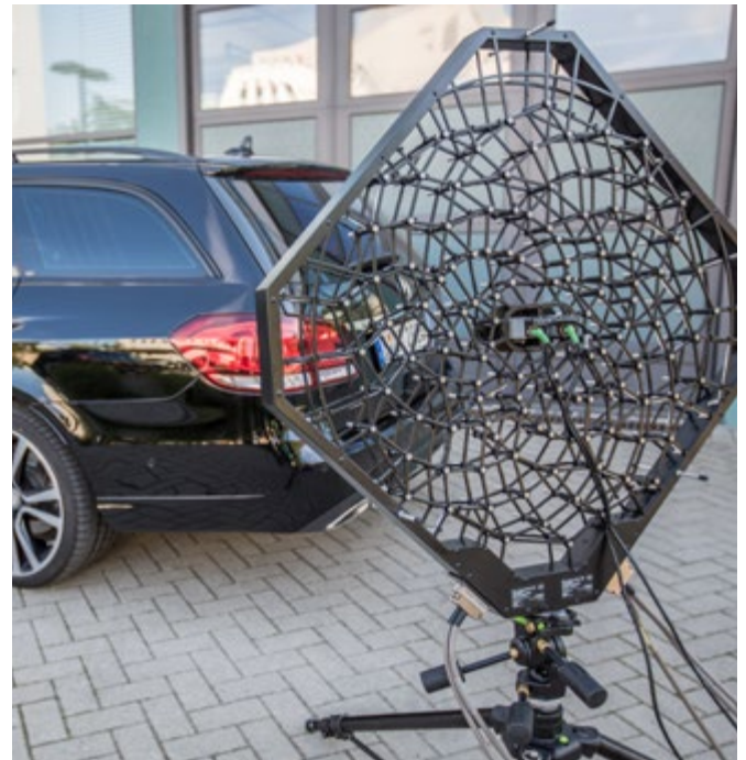
Fibonacci array measurement set up