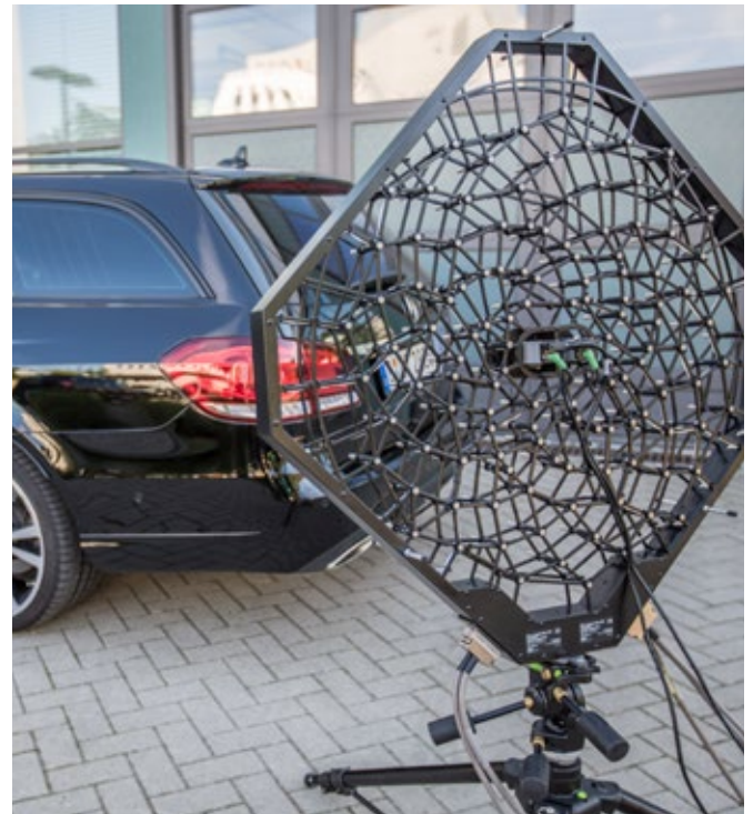
Fibonacci array measurement set up