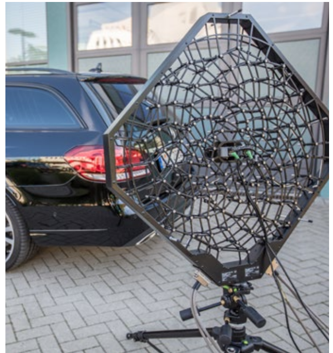
Fibonacci array measurement set up