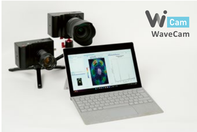
Highspeed cameras Chronos 1.4 and 2.1 with WaveCam software by gfai tech

Optical Flow Based Time and Frequency ODS