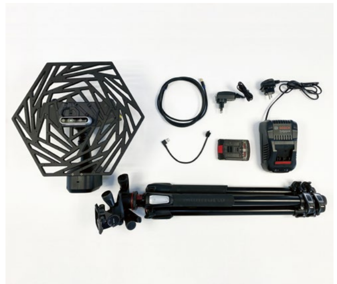
Acoustic Camera Mikado set