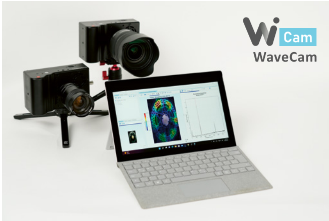
Highspeed cameras Chronos 1.4 and 2.1 with WaveCam software by gfai tech

Optical flow based time and frequency ODS